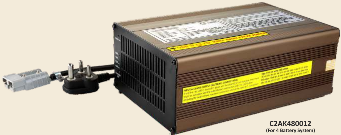
C2AK480012 (For 4 Battery System)

Electric Rickshaw Charger is designed to fulfill charging needs of Electric Rickshaws. This intelligent charger is capable of operating at wide Input AC voltage range of 170-300VAC. It has been designed to withstand the adverse Indian power conditions. Efficient, compact in size, 4 stage battery charging algorithm are some of its salient features when compared to the linear chargers (bulky transformer based chargers). Its high efficiency and battery life extension features are its USP.